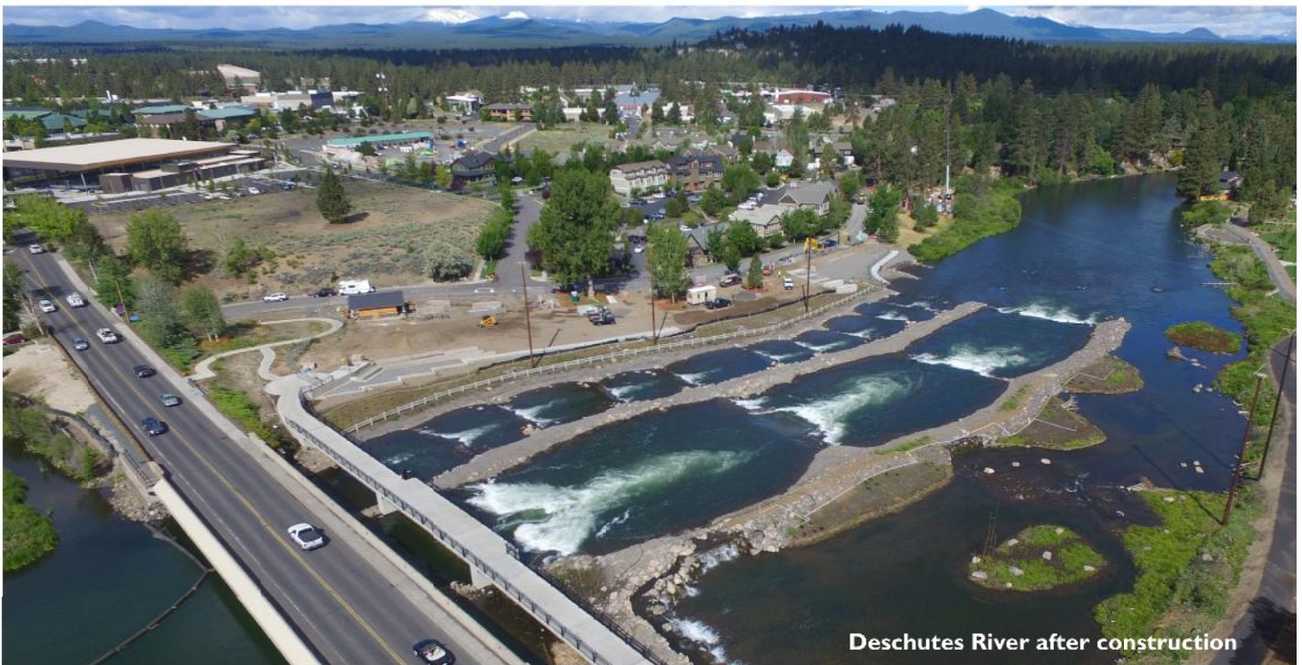
Deschutes River after construction

The Bend Parks and Recreation District pursued a whitewater park to replace the hazardous 9-ft Colorado Dam on the Deschutes River. Following initial feasibility analysis, BPRD soon recognized that the project was not only a whitewater park, but a river project with sensitive aquatic species, dam stabilization issues and fish and boat passage concerns. RiverRestoration was retained in 2010 to develop realistic and practical solutions to these issues. Our philosophy of looking at river system function, combined with our rigorous and analytical design of whitewater features was the recipe for success on the Deschutes River. RiverRestoration quickly identified improvements to the concept for benefits to whitewater, passage and habitat. RiverRestoration provided the river engineering required for the success of the Colorado Dam Paddle Trails Improvements including 3D CFD design of unique features for river surfing and kayaking. The instream features incorporated Obermeyer Hydro, Inc. dynamic gates for a tailored recreational experience for all flow rates and user abilities. Project direction and goals were guided through communication and collaboration with stakeholders throughout the design process. The project construction was completed in February 2016 and has become a key recreational asset for the community for all types of river users.