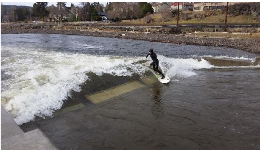
River surfing Drop 3 final product

PASSAGE CHANNEL: Accommodations for river users and fish to navigate the Deschutes River through Bend, Oregon.